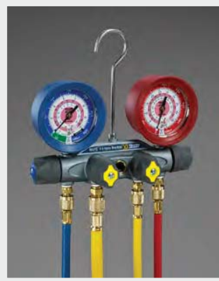
Replacement parts on page 46.

The BRUTE II ™ 4-Valve Test and Charging Manifold provides the flow that's proven faster than any conventional manifold. The aluminum alloy body is forged for strength and reliability with 3/8" bores through the body to speed the job.